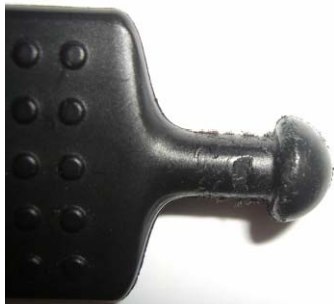
Normal Usage Picture

Here is a picture of the shaft area that shows normal wearing after normal usage: