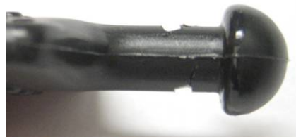
Wear Test Picture

Below is another picture of the shaft that shows the result of one of our validation tests. This test estimated nearly 8 years of usage with the socket area in the EXACT same location on the shaft of the ball clip, as evidenced by the deep groove. Even this worst case scenario was not enough to break the shaft: