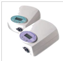
GoodKnight 420 CPAP System