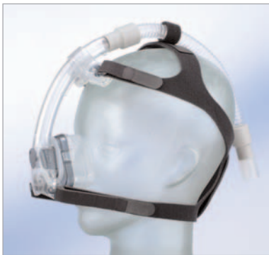
DreamFit Nasal Mask