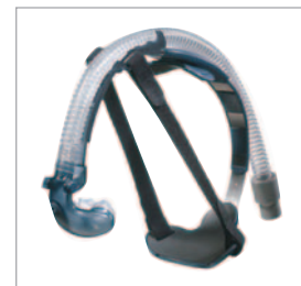
Breeze SleepGear Interface With Nasal Pillows

Caution: Federal (U.S.A) law restricts this device to sale by or on the order of a physician.