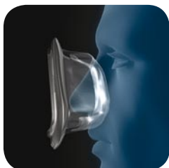
... and contracts