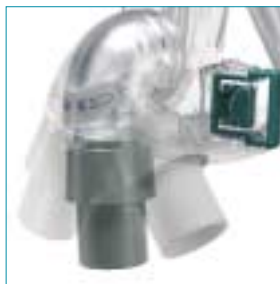
Rotating elbow—flexibility of air tube position

ResMed Corp Poway, CA, USA +1 858 746 2400 OR 1 800 424 0737 (toll free), ResMed Ltd Bella Vista, NSW, Australia, 61 (2) 8884 1000 or 1 800 658 189 (toll free). Offices in Austria, Finland, France, Germany, Hong Kong, Japan, Malaysia, Netherlands, New Zealand, Singapore, Spain, Sweden, Switzerland, United Kingdom (see website for details). Protected by patents: AU 710733, AU 741003, AU 766623, AU 772832, AU 775051, AU 777033, CA 2261790, DE 29724224, EP 0956069, NZ 513052, NZ 526165, US 6112746, US 6357441, US 6374826, US 6412487, US 6439230, US 6463931, US 6532961, US 6557556, US 6581602, US 6634358, US 6691707, US 6796308. Other patents pending. Protected by design registrations: AU 139764, DE 49911833, DE 40301991, FR 997839, FR 031425, JP 1117921, JP 1197930, US D443355, US D486227, US D493522. Others pending. AutoSet, Ultra Mirage, and Mirage are trademarks of ResMed Ltd. ©2005 ResMed Ltd. 1010456/1 05 02