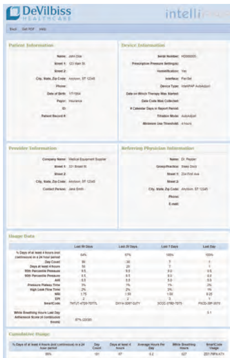
IntelliPAP AutoAdjust Summary Report Using SmartCode System