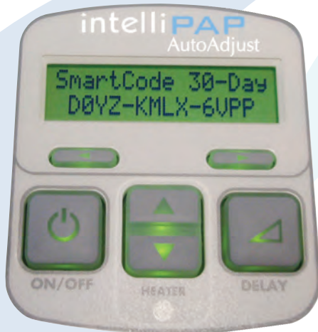
DeVilbiss SmartCode as displayed on IntelliPAP