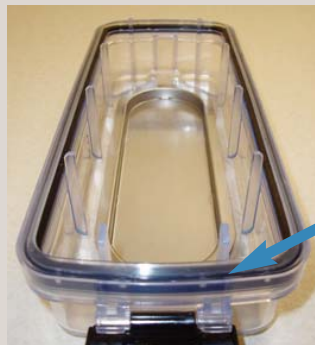
BLACK MIDDLE SEAL