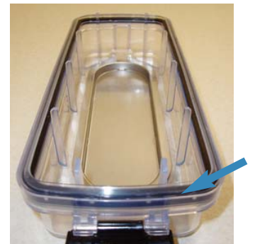
BLACK MIDDLE SEAL