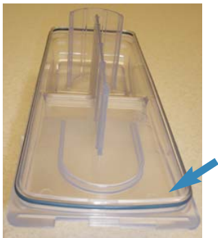
BLUE MIDDLE SEAL