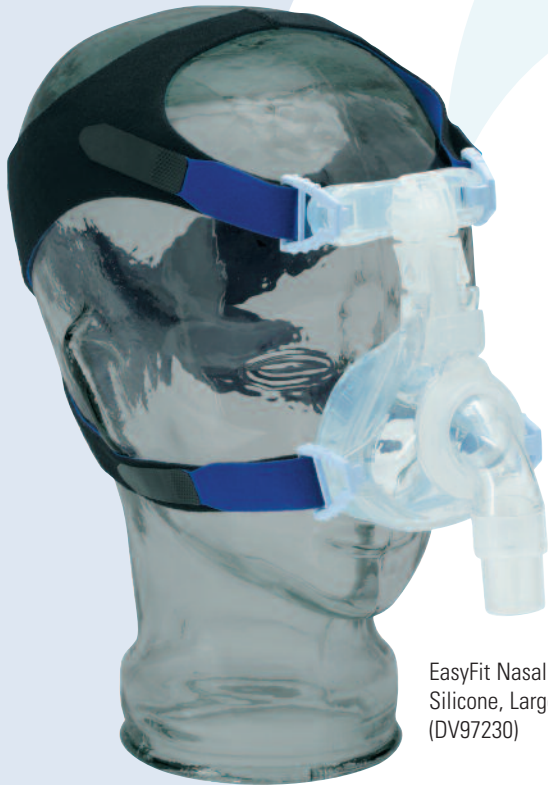
EasyFit Nasal Mask Silicone, Large (DV97230)

The ball-and-socket joint at the tubing connector accommodates even the most active sleeper and contributes to the mask's overall comfort. The unique whisper-quiet EasyFit exhalation system is designed in such a way that neither the patient nor sleeping partner is disturbed by the flow of exhaled air.