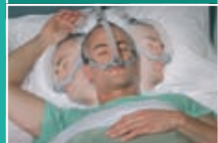
Contoured Mask Frame & "Off-the-Lip" Pillows

Elegant in design and simplicity, let the Opus 360 Nasal Pillows Mask from Fisher & Paykel Healthcare work for you today!