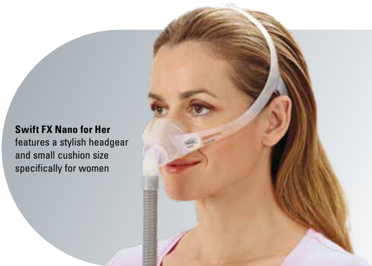
Swift FX Nano for Her features a stylish headgear and small cushion size specifically for women

The Swift FX Nano's simple, compact design helps reduce patient anxiety at setup so they're more likely to stay compliant. And because it's incredibly easy to fit and maintain, you spend less time troubleshooting and answering patient callbacks.